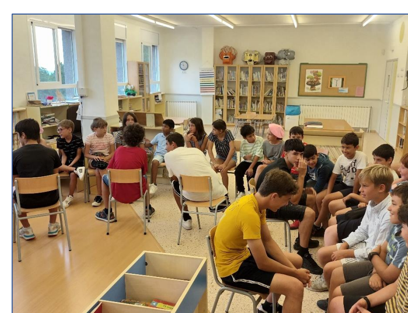
Figure 2. Network meetings and group work.