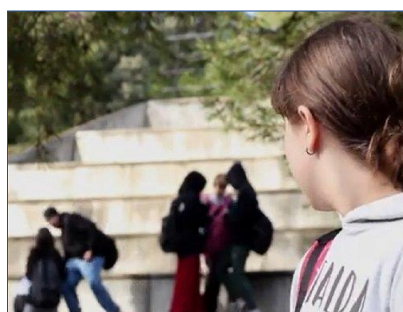
Figure 1. ComViure Program in educational settings

The network boasts a general consensus that orients the design of the comprehensive programs 1 using the framework of socio-emotional development, including the revision of the concepts of provention (application resources that promote well-being and development of life-strategies from their own potentials), awareness-raising (making risk situations such as violence or other vulnerability factors visible and applying resources that aid awareness) and observation (resources for continuous preventive detection in which well-being and relationships are observed, as well as the functioning of communication channels to receive alerts).